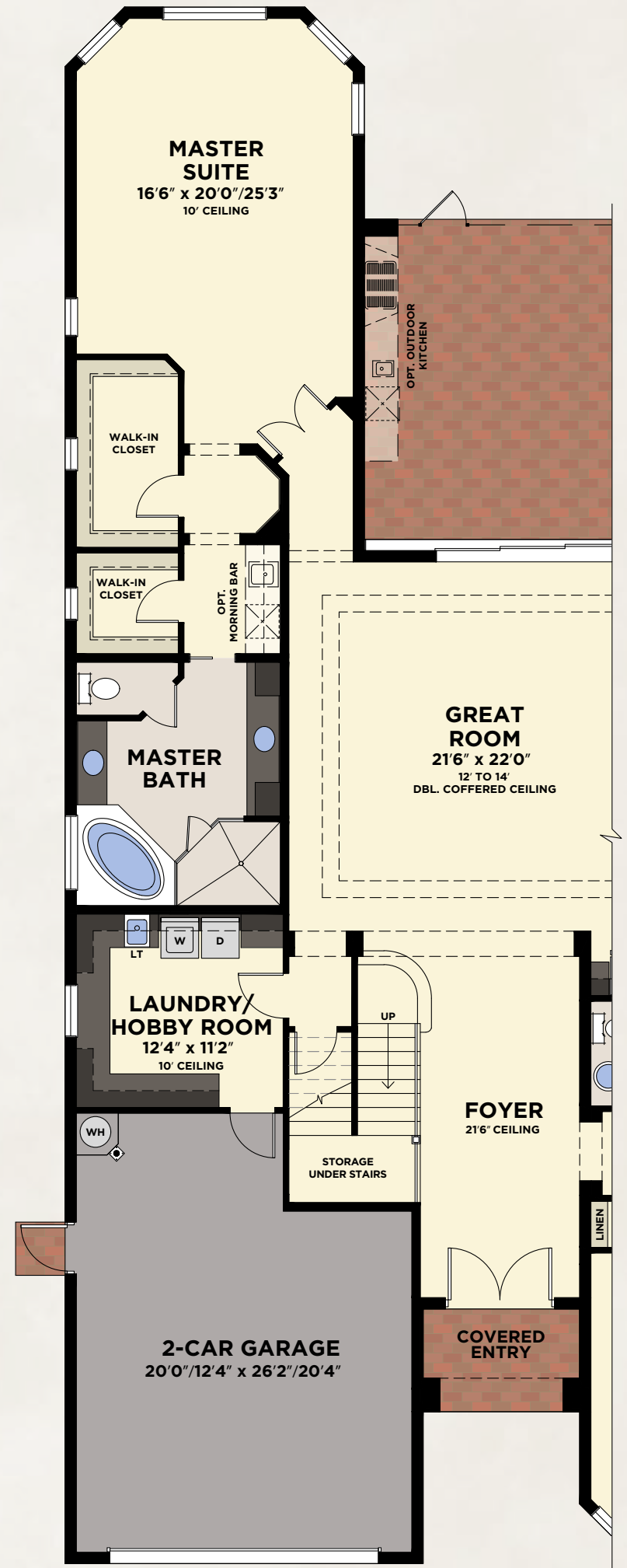
AVAILABLE LAUNDRY/HOBBY ROOM AND 2-CAR GARAGE